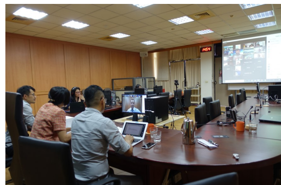
In the meeting