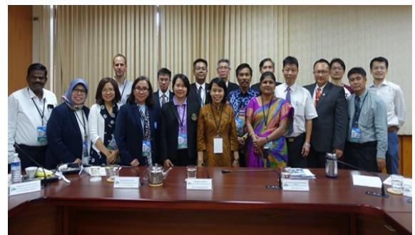
Assembly meeting in 2019

Since 2018, the Secretariat has been organizing the “UNTA Bilateral Faculty Exchange Program” to promote deeper cooperation between partners. Through the program, NPUST has already hosted more than 30 faculty members and graduate students affiliated with 17 bilateral projects. So far, the main focus of these has been placed on food science, animal science, plant medicine, aquaculture, biological science and technology, civil engineering and biomechatronics engineering.- Continued on p.8