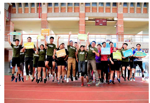
Opening activity of Hunt Taiwan

With considerable concern stemming from the global Covid-19 outbreak, NPUST’s Office of International Affairs held an event designed to encourage students to stay in Taiwan over the summer break. Divided into 8 major themes, the “Hunt Taiwan” activity ran from July 10 to August 27 and gave students a chance to experience Taiwan in a new and exciting way. - Continued on p.9