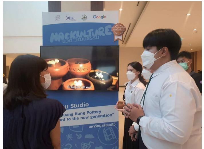
Maejo University Student explains the result of their work.