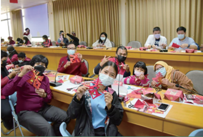
NPUST international students enjoyed the experience of paper cutting.

sia, Malaysia, Haiti and Belgium. Together they enjoyed the experience of paper cutting and the rich Lunar New Year atmosphere.