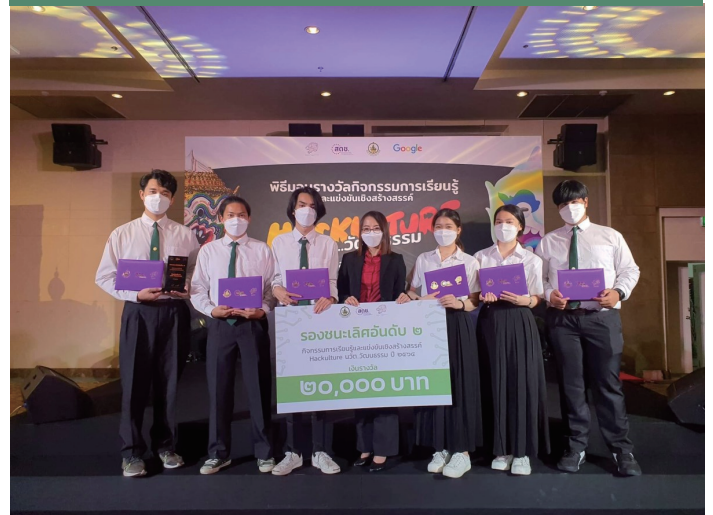
The winning team members of Maejo University.