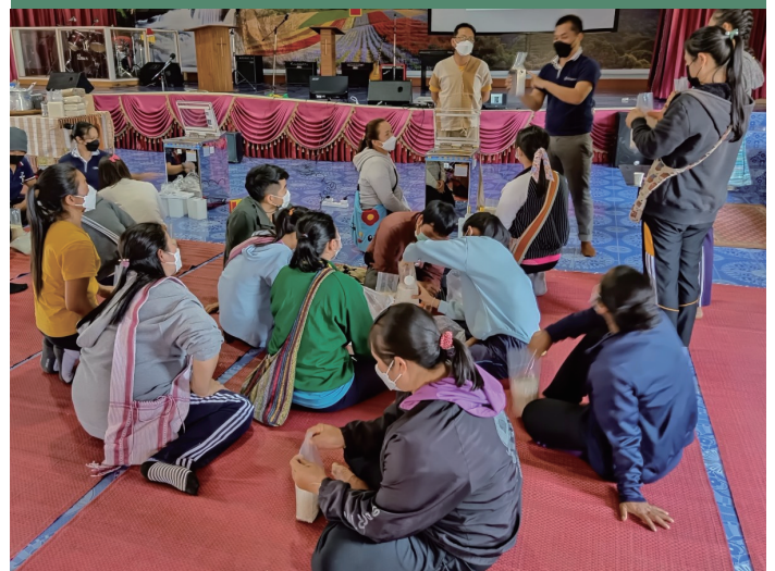
Students learning skill of packaging rice and Doi rice.