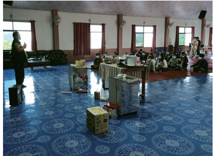
The speakers were from Maejo University, Faculty of Liberal Arts.

Faculty of Liberal Arts by Center for Social Innovation and Peace Studies organized activities under the project to build tribal farmers to become entrepreneurs, "Doi Omkoi Rice" with budget support from the Education Equality Fund (NSO), Community-Based Occupational Development Fund. The goal of this activity was to develop skills for underprivileged workers to become a new generation of entrepreneurs to be able to be self-reliant in a sustainable manner and to strengthen the community. This activity was to practice the skills of packaging rice and Doi rice processing skills into modern products; to create income opportunities from uncertainty in economic crop prices; and, to enhance knowledge and skills for adapting to modern markets and capital. The target group was farmers who were informal workers at Ban Mae Tom, Ban Mae Tom Bon and Ban Ka Be Din, Tambon Omkoi, Omkoi District, Chiang Mai Province. The speakers were from Maejo University, Faculty of Liberal Arts, Chiang Mai University, Faculty of Humanities, Home and Community, Faculty of Fine Arts, Thai Arts and Local Philosophers. In addition, this activity received cooperation and support from local authorities, led by the Prime Minister of Omkoi Subdistrict Administrative Organization.