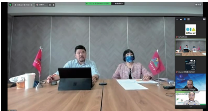
The 2021 UNTA online workshop "Young voices in SDGs" group photo.